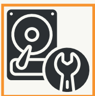
DAMAGE MEDIA RECOVERY