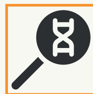
ON-SCENE CRIME FORENSICS