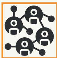
OSINT AND SOCIAL MEDIA