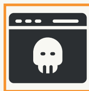
DARKNET AND BLOCKCHAIN